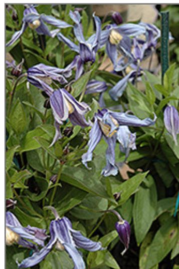
Caerulea Solitary Clematis flowers

Caerulea Solitary Clematis is recommended for the following landscape applications;