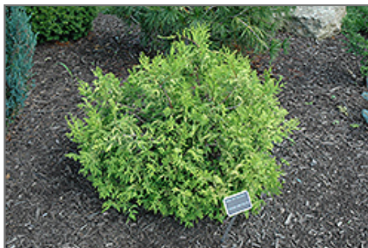
Vintage Gold Dwarf Moss Falsecypress