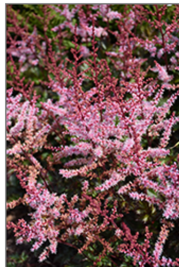
Delft Lace Astilbe flowers

Delft Lace Astilbe is recommended for the following landscape applications;