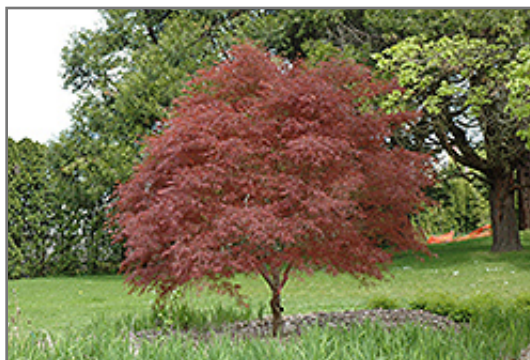
Dwarf Red Pygmy Japanese Maple