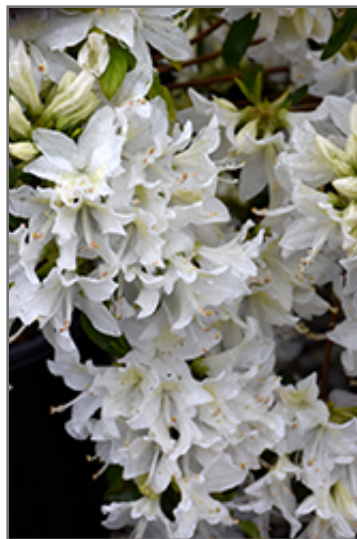
Cascade Azalea flowers