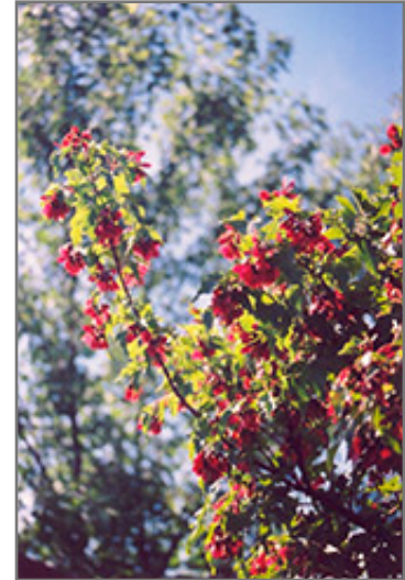
Embers Amur Maple fruit

This tree does best in full sun to partial shade. It is very adaptable to both dry and moist locations, and should do just fine under average home landscape conditions. It is not particular as to soil type or pH. It is highly tolerant of urban pollution and will even thrive in inner city environments. This is a selected variety of a species not originally from North America.