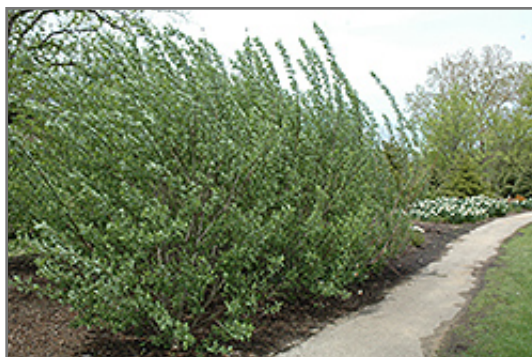
French Pussy Willow