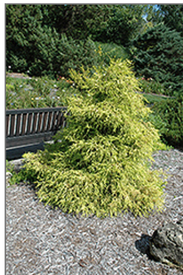
Lemon Thread Falsecypress