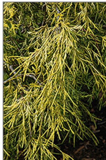
Lemon Thread Falsecypress foliage