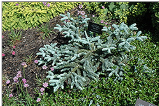
Prostrate Blue Noble Fir

Prostrate Blue Noble Fir will grow to be about 18 inches tall at maturity, with a spread of 6 feet. It tends to fill out right to the ground and therefore doesn't necessarily require facer plants in front. It grows at a slow rate, and under ideal conditions can be expected to live for 70 years or more.