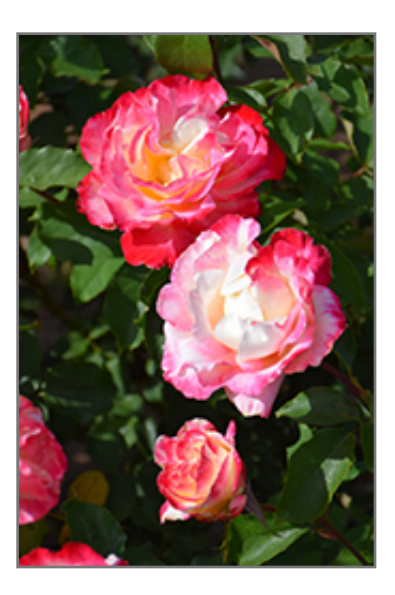
Double Delight Rose flowers