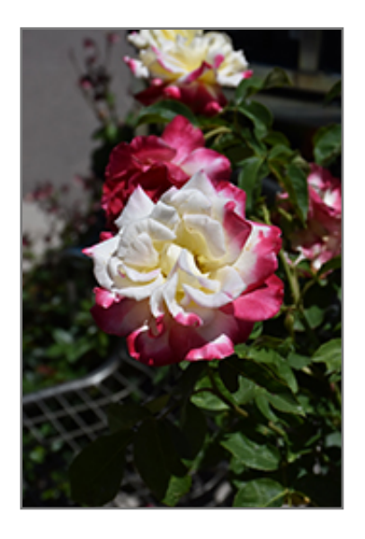
Double Delight Rose flowers