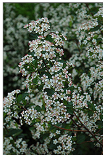
Black Chokeberry flowers