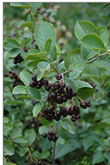
Black Chokeberry fruit