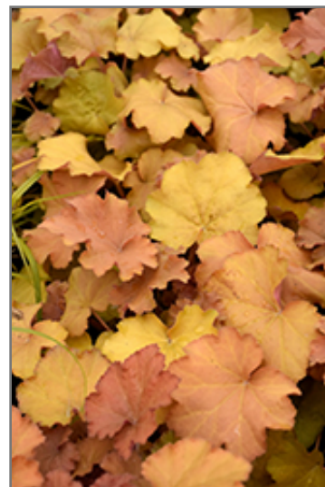
Caramel Coral Bells foliage

Caramel Coral Bells is recommended for the following landscape applications;