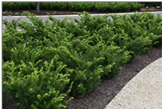
Densiformis Yew