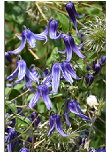
Solitary Clematis flowers