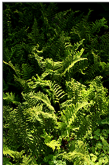
Lady Fern foliage