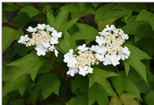
Redwing Highbush Cranberry flowers

Redwing Highbush Cranberry is a dense multi-stemmed deciduous shrub with an upright spreading habit of growth. Its average texture blends into the landscape, but can be balanced by one or two finer or coarser trees or shrubs for an effective composition.