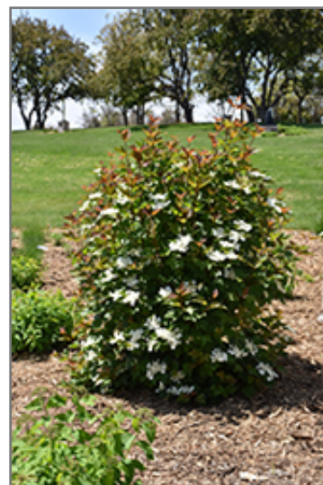
Redwing Highbush Cranberry in bloom