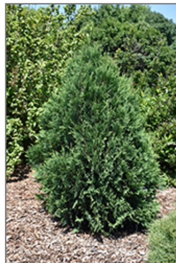
Technito Arborvitae