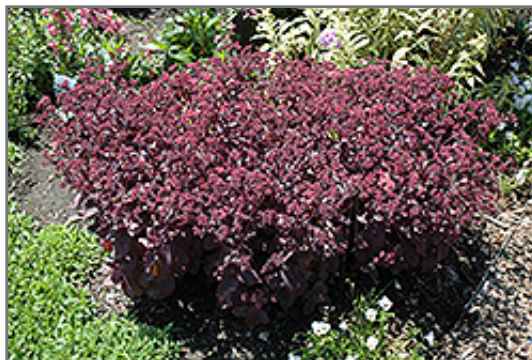
Xenox Stonecrop in bloom