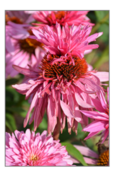
Double Decker Coneflower flowers

Beautiful and unique, this selection features 2 tiers of deep rosy-pink flowers, one recurved along the bottom while the other grows upwards on top of a deep brown cone; excellent for fresh or dried arrangements; heat, drought and humidity tolerant