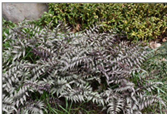
Pewter Lace Painted Fern