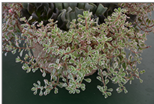
Tricolor Stonecrop