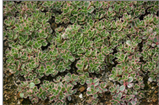
Tricolor Stonecrop flowers

Tricolor Stonecrop is a fine choice for the garden, but it is also a good selection for planting in outdoor pots and containers. Because of its spreading habit of growth, it is ideally suited for use as a 'spiller' in the 'spiller-thriller-filler' container combination; plant it near the edges where it can spill gracefully over the pot. Note that when growing plants in outdoor containers and baskets, they may require more frequent waterings than they would in the yard or garden.