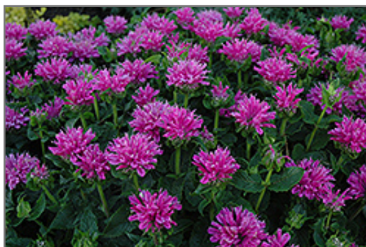
Petite Delight Beebalm flowers