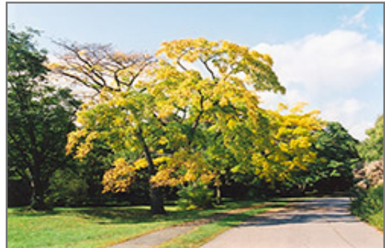
Amur Cork Tree in fall

* This is a 'special order' plant - contact store for details