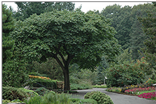
Amur Cork Tree