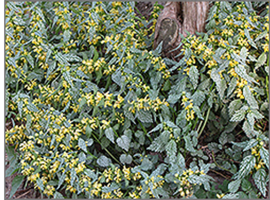
Hermann's Pride Yellow Archangel in bloom

This plant does best in partial shade to shade. It is an amazingly adaptable plant, tolerating both dry conditions and even some standing water. It is considered to be drought-tolerant, and thus makes an ideal choice for a low-water garden or xeriscape application. It is not particular as to soil type or pH. It is highly tolerant of urban pollution and will even thrive in inner city environments. This is a selected variety of a species not originally from North America. It can be propagated by division; however, as a cultivated variety, be aware that it may be subject to certain restrictions or prohibitions on propagation.