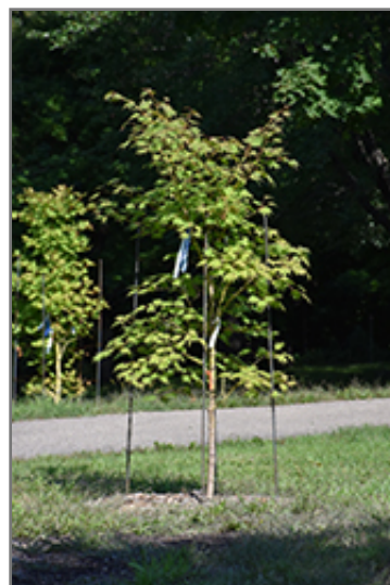
Jack Frost Arctic Jade Maple