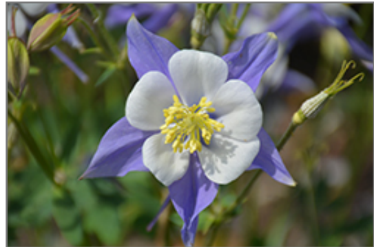
Songbird Blue Jay Columbine flowers

Songbird Blue Jay Columbine is a fine choice for the garden, but it is also a good selection for planting in outdoor pots and containers. With its upright habit of growth, it is best suited for use as a 'thriller' in the 'spiller-thriller-filler' container combination; plant it near the center of the pot, surrounded by smaller plants and those that spill over the edges. Note that when growing plants in outdoor containers and baskets, they may require more frequent waterings than they would in the yard or garden.