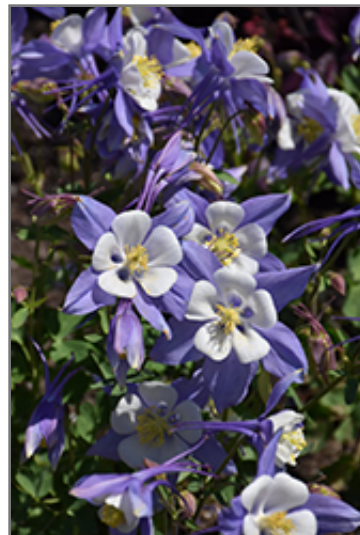
Songbird Blue Jay Columbine flowers