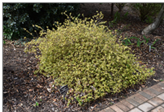
Twist of Orange Glossy Abelia