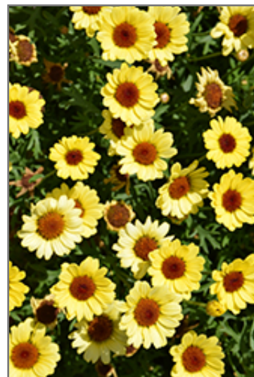
Grandessa Yellow Marguerite Daisy flowers