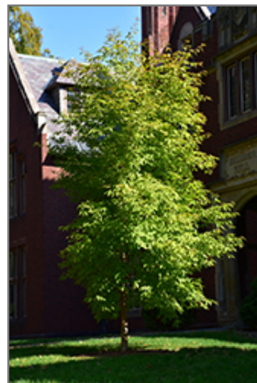
Three Flowered Maple

Three Flowered Maple will grow to be about 30 feet tall at maturity, with a spread of 30 feet. It has a low canopy with a typical clearance of 5 feet from the ground, and should not be planted underneath power lines. It grows at a slow rate, and under ideal conditions can be expected to live for 70 years or more.