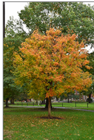
Three Flowered Maple in fall