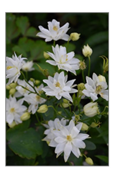
Clementine White Columbine flowers

Dainty, upward facing white flowers resemble double-flowering clematis; on a compact, many-branched plant; makes a welcome addition to shade and woodland gardens