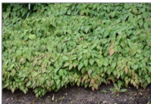
Bishop's Hat