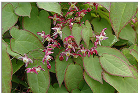
Bishop's Hat flowers