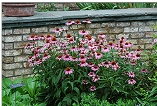
Magnus Coneflower in bloom