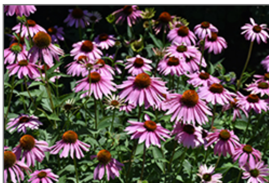
Magnus Coneflower flowers