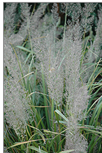
Korean Reed Grass fruit