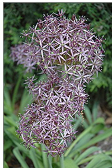
Star Of Persia Onion flowers