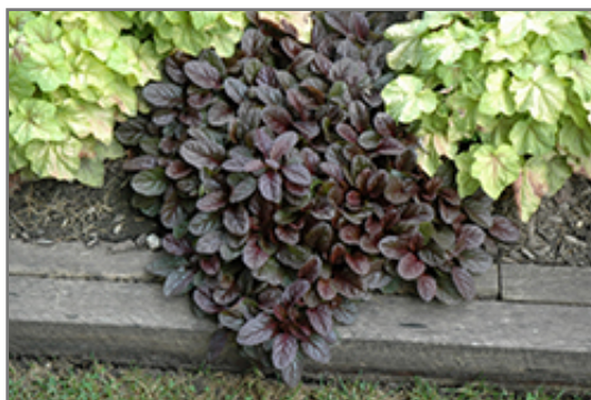
Mahogany Bugleweed