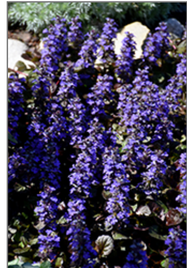
Mahogany Bugleweed flowers

This plant does best in partial shade to shade. It does best in average to evenly moist conditions, but will not tolerate standing water. It is not particular as to soil type or pH. It is somewhat tolerant of urban pollution. Consider covering it with a thick layer of mulch in winter to protect it in exposed locations or colder microclimates. This is a selected variety of a species not originally from North America. It can be propagated by division; however, as a cultivated variety, be aware that it may be subject to certain restrictions or prohibitions on propagation.