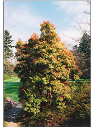
Valley Fire Japanese Pieris

* This is a 'special order' plant - contact store for details