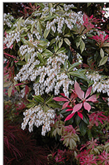
Valley Fire Japanese Pieris flowers