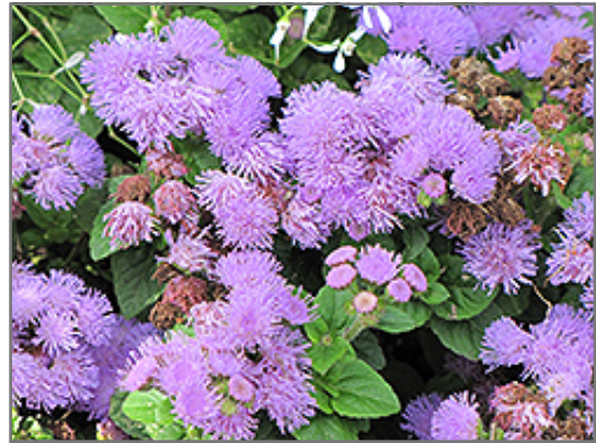
Artist Alto Blue Flossflower flowers