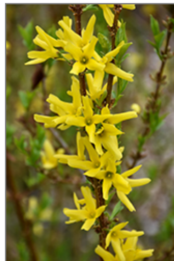
Bronx Forsythia flowers