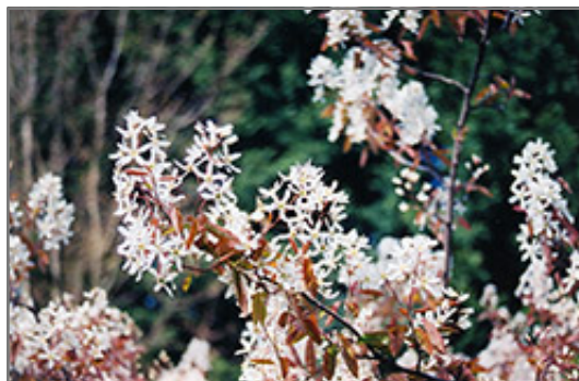
Cole's Select Serviceberry flowers

Cole's Select Serviceberry will grow to be about 15 feet tall at maturity, with a spread of 15 feet. It has a low canopy with a typical clearance of 3 feet from the ground, and is suitable for planting under power lines. It grows at a medium rate, and under ideal conditions can be expected to live for 40 years or more.