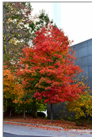
Fall Fiesta Sugar Maple in fall