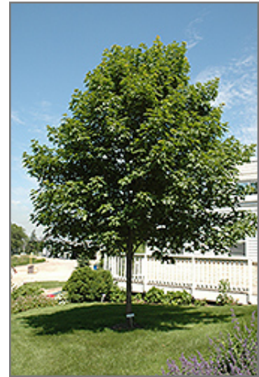
Fall Fiesta Sugar Maple

This tree should only be grown in full sunlight. It prefers to grow in average to moist conditions, and shouldn't be allowed to dry out. It is not particular as to soil pH, but grows best in rich soils. It is somewhat tolerant of urban pollution. This is a selection of a native North American species.