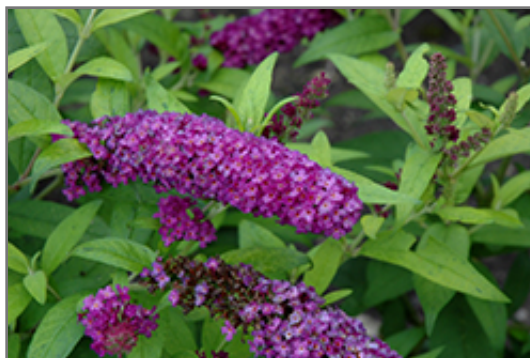
Monarch Crown Jewels Butterfly Bush flowers