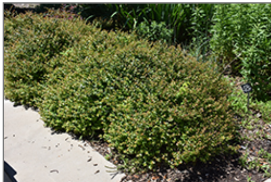
Rose Creek Abelia

Rose Creek Abelia makes a fine choice for the outdoor landscape, but it is also well-suited for use in outdoor pots and containers. Because of its height, it is often used as a 'thriller' in the 'spiller-thriller-filler' container combination; plant it near the center of the pot, surrounded by smaller plants and those that spill over the edges. It is even sizeable enough that it can be grown alone in a suitable container. Note that when grown in a container, it may not perform exactly as indicated on the tag - this is to be expected. Also note that when growing plants in outdoor containers and baskets, they may require more frequent waterings than they would in the yard or garden. Be aware that in our climate, this plant may be too tender to survive the winter if left outdoors in a container. Contact our experts for more information on how to protect it over the winter months.