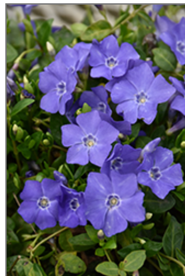
Bowles Periwinkle flowers