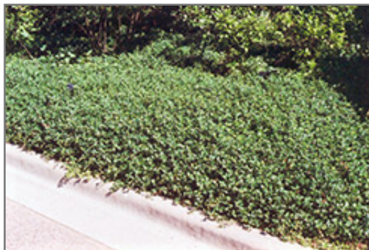
Bowles Periwinkle