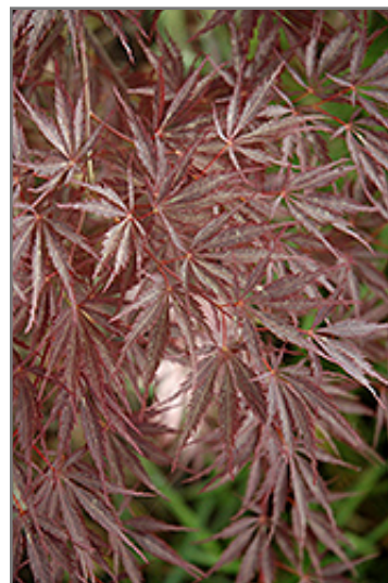
Sherwood Elfin Japanese Maple foliage