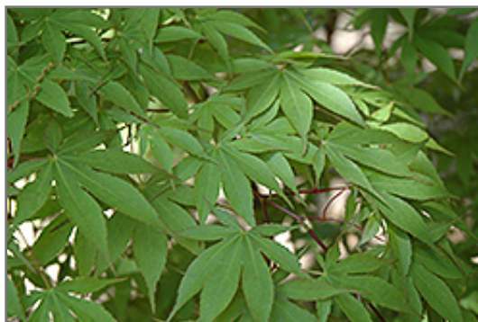
Osakazuki Japanese Maple foliage

Osakazuki Japanese Maple is recommended for the following landscape applications;