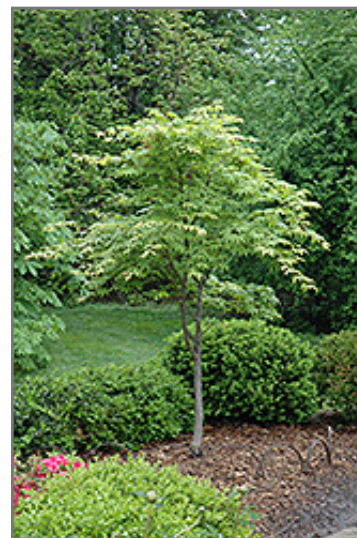
Osakazuki Japanese Maple