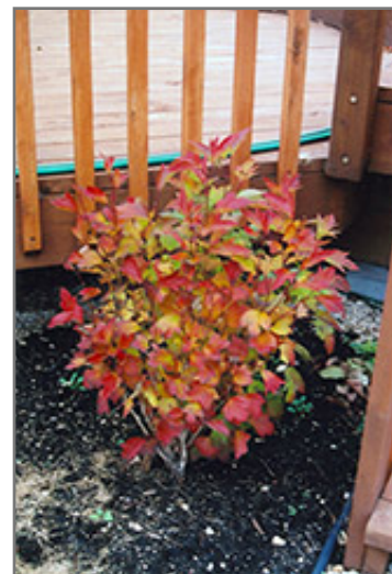
Compact Highbush Cranberry in fall