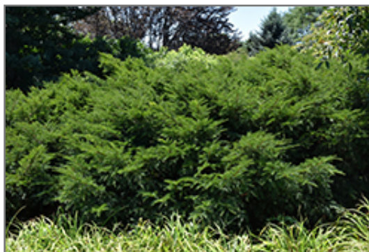
Runyan Yew