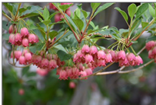
Redvein Enkianthus flowers