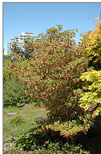
Redvein Enkianthus in bloom