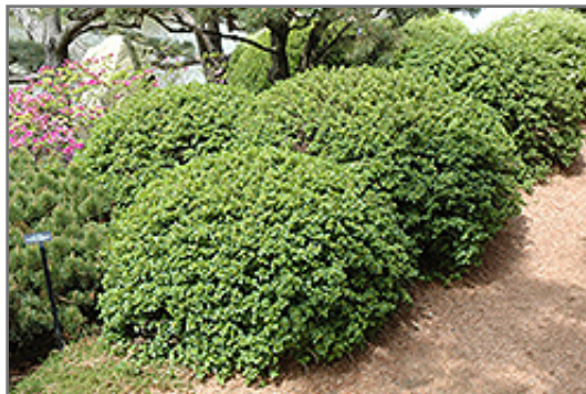
Green Mound Alpine Currant

Green Mound Alpine Currant will grow to be about 3 feet tall at maturity, with a spread of 24 inches. It tends to fill out right to the ground and therefore doesn't necessarily require facer plants in front. It grows at a medium rate, and under ideal conditions can be expected to live for approximately 30 years.