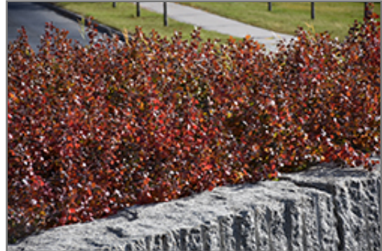
Gro-Low Fragrant Sumac in fall

This shrub performs well in both full sun and full shade. It is very adaptable to both dry and moist locations, and should do just fine under typical garden conditions. It is not particular as to soil type, but has a definite preference for acidic soils, and is subject to chlorosis (yellowing) of the foliage in alkaline soils. It is highly tolerant of urban pollution and will even thrive in inner city environments. Consider applying a thick mulch around the root zone in winter to protect it in exposed locations or colder microclimates. This is a selection of a native North American species.