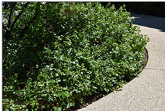
Gro-Low Fragrant Sumac